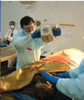
Three sets of photos of the dentition were required for each victim.