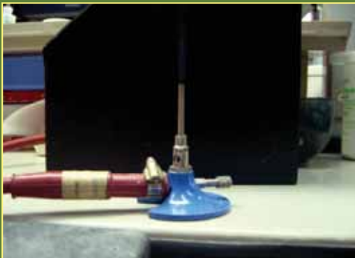
Cannot really see the flame very well.