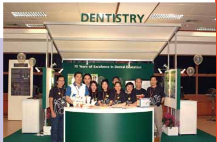
The Dental booth.