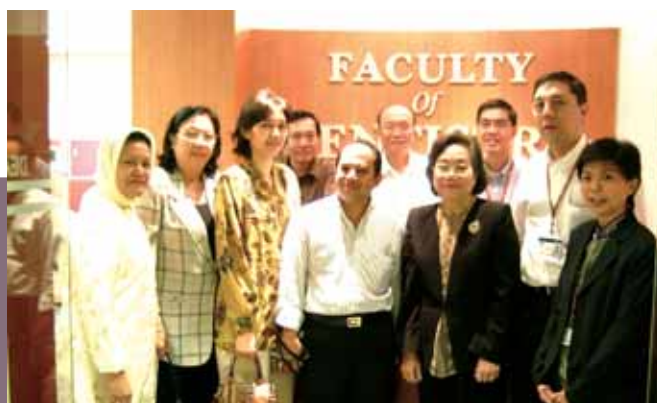
Visitors from Indonesia with staff of the Faculty.