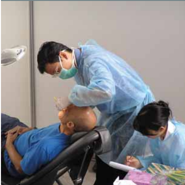
Students carrying out dental screening.

While the dental students battled the scorching morning sun and braved the evening downpour, their spirits were kept sky high. There was a constant stream of visitors and the students were kept very busy carrying out dental screening and giving advice. At the close of the event, the final count was 446 screenings. The aim of increasing the public's awareness of Dental Health was certainly achieved! 🎉