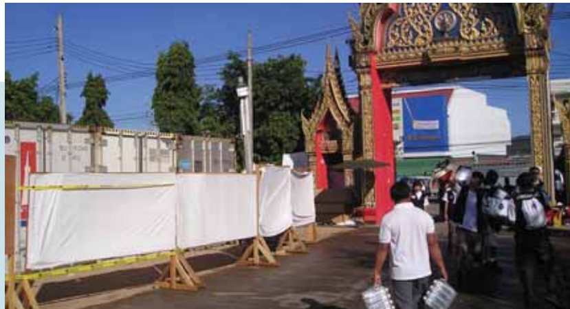
The temple where the temporary mortuary was set up. Behind the white screens are the refrigerated containers used for storage of the bodies.

When I learnt about the massive tsunami that had devastated southern Asia, I was completing my training in forensic odontology. An air-crash had fueled the inspiration to help in times of disaster and first gave me the notion to train in forensic odontology. As the days went by, the massive scale of the catastrophe became apparent, with the death toll climbing each day. A thought played in my mind; that this time I could make a difference, instead of helplessly watching the devastation on the news.