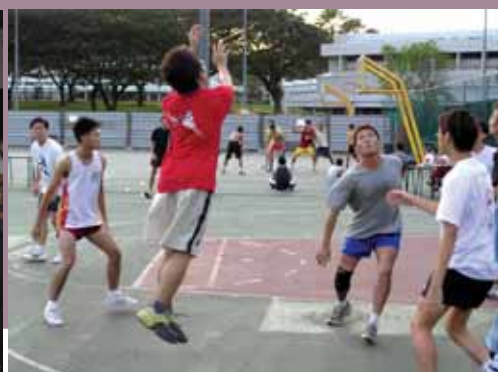
Dental students in action.