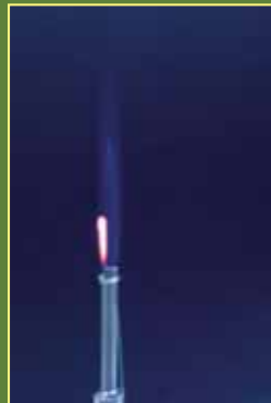
Wow! So much more obvious!

Well done and congratulations again to the winning teams! 🎉