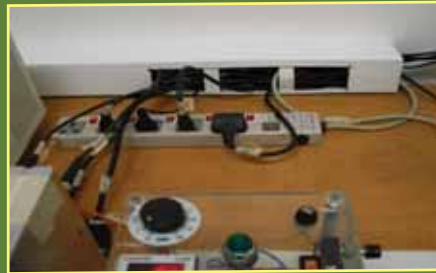
So much neater now!